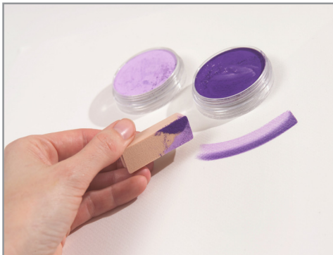
5. Double load Sofft™ Tool with two colors and apply. Lift 1 st color on one side, then 2 nd color on the other side of the same tool. Tip: Load the palest color first.