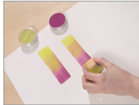
4. Mix colors - like paint - to create intermediate colors. (Traditional painting/color mixing rules apply.) Tip: If a pan's surface becomes contaminated with another color, "clean" pan by gently wiping away the contamination with a clean sponge or paper towel.