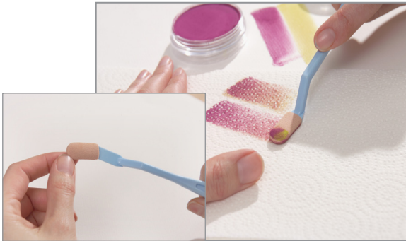
3. "Clean" Sofft tools between colors by wiping on a dry paper towel to remove color from the surface of the sponge. The same tool can then be used with several colors. Tip: Wipe KNIFE/COVER side to side so the paper towel doesn't drag the cover off.