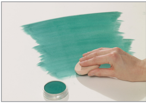
1. Apply a large area of color using a large sponge (Big Oval or Angle Slice) – it's so much easier to do this with PanPastel compared to pastel sticks for backgrounds / underpaintings / "dry washes" and very little dust is generated.