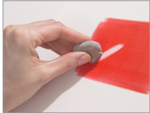
6. Erase color(s) with any eraser